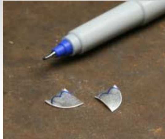
2. Draw the top of the heart shape on the quarters and cut out with shears.