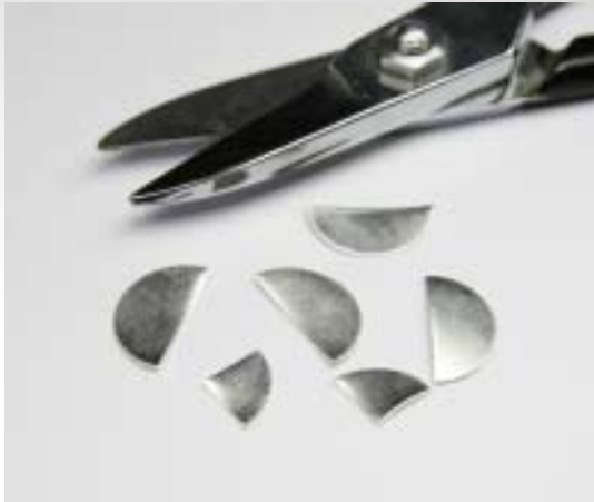
1. Cut the discs. They do not need to be flattened.