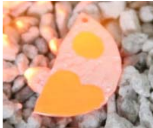
6. Torch fire. The silver should glow a dull salmon color, the gold bright orange.