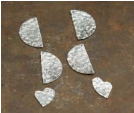
3 & 4. Texture each part, mark and drill holes.