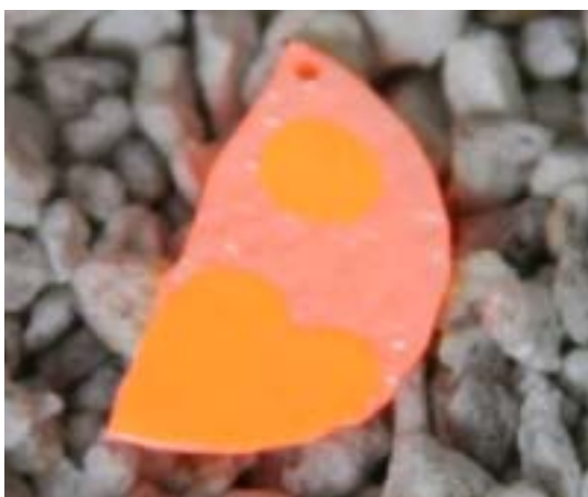
Caution! This is overheated. Silver should not be deep salmon or red.